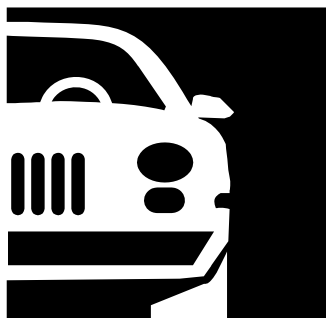
Car rental from national companies is part of the American Legion benefits you gain from membership.

trip a lot more enjoyable. This discount is subject to availability and other restrictions. To receive your American Legion Discount, mention BCD# T756500 when reserving through your agent or Budget at 1-800-455-2848 .