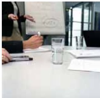
Meetings are important to pass information and to do the work of the American Legion.

Read about new projects coming along in Post 725.