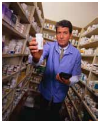
American Legion Prescription Discount Program may save you money.