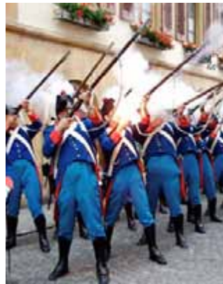
Ceremonial Firing Squad in colonial uniforms.

To learn more, contact Larry Sunderland at (760) 780-8312.