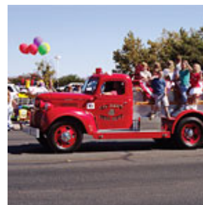
Hesperia Days Sept 22nd - 23rd